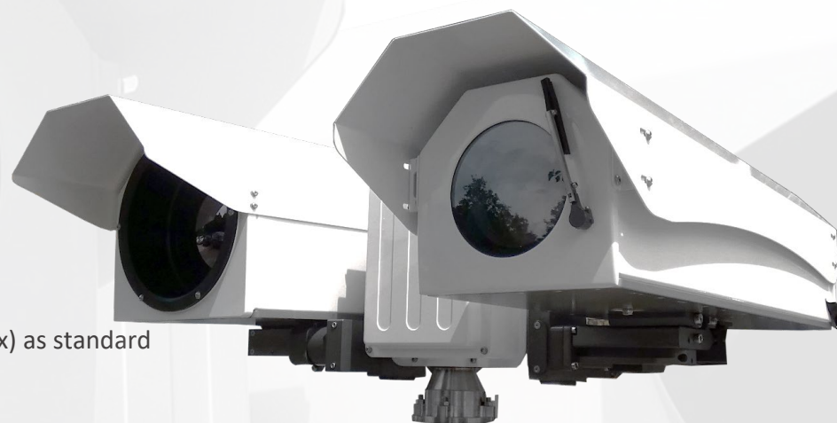
Above: Typical Jaegar Ranger, wiper optional (models will vary)

* Requires the NexOS performance pack and the gyro options